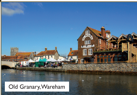
Old Granary, Wareham

£1.25m donated to, and raised for, community organisations since 2013