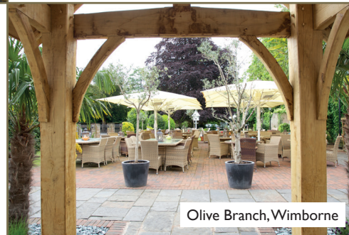
Olive Branch, Wimborne