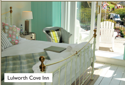
Lulworth Cove Inn